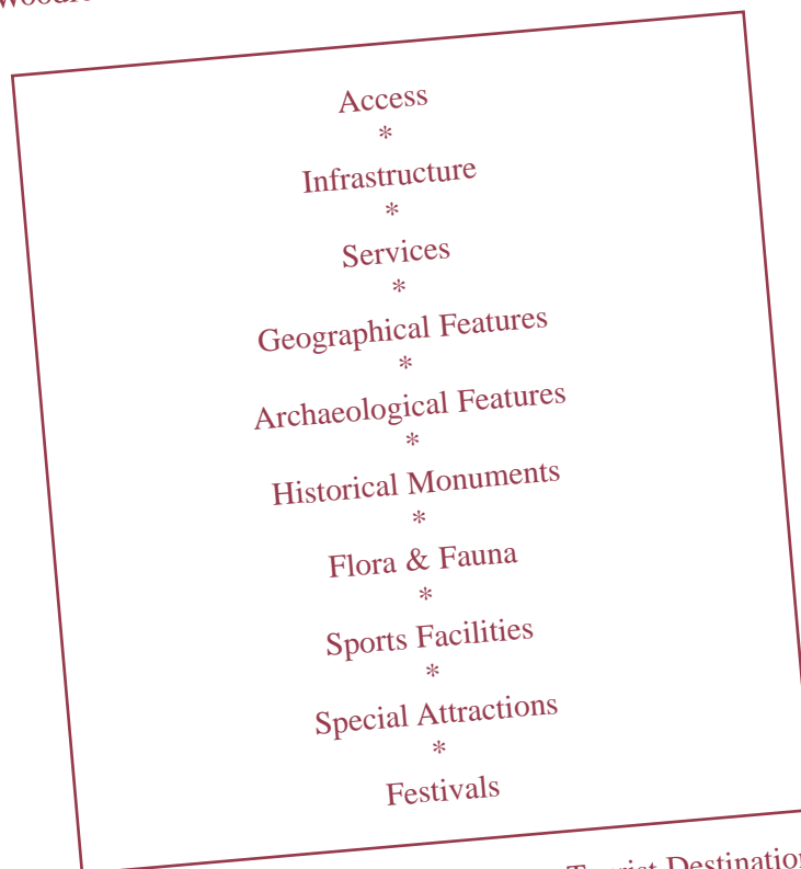
Figure 2 - Features of an Attractive Tourist Destination

We visited the IRD offices at 4.00pm on Tuesday 5th March. IRD stands for Integrated Regional Development. I found out about community development and were given data on tourist preferences (see Figure 2). The data was helpful to me for comparing features of the Woodford area with tourist requirements.