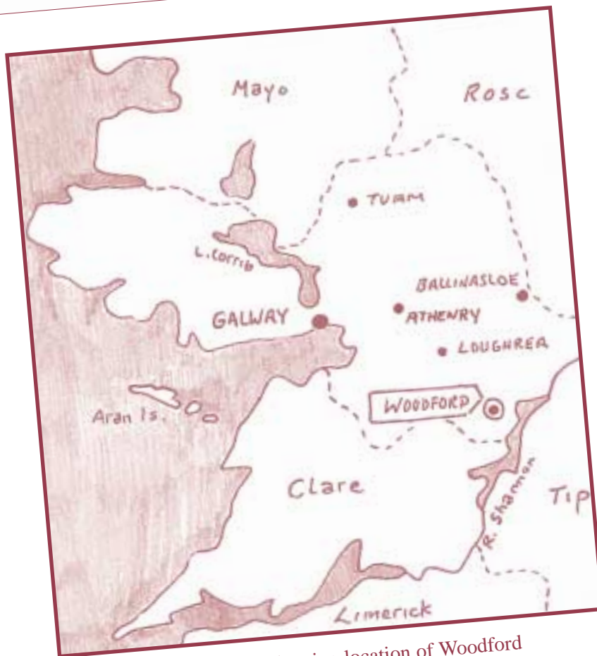
Figure 1. Map showing location of Woodford